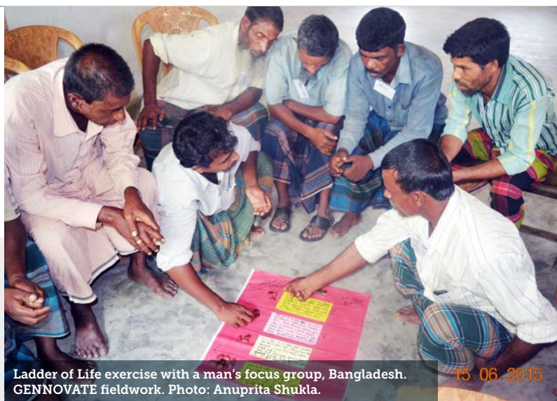
Ladder of Life exercise with a man's focus group, Bangladesh. GENNOVATE fieldwork.

[Read:] Now we're going to focus on how individuals and their households move out of poverty. For this discussion, we are going to look separately at what poor men and poor women have been able to do in this village to climb the ladder and improve the wellbeing of their households.