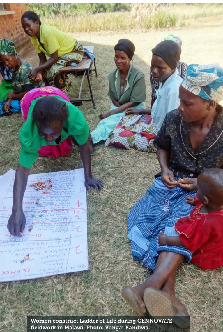
Women construct Ladder of Life during GENNOVATE fieldwork in Malawi.

The Ladder of Life is a focus group tool conducted with poor women and men. It is meant to explore their understandings and interpretations of the different wellbeing groups and the poverty trend in their community, and the key factors and processes seen to shape these dynamics. Here we review the purpose of the tool, highlight key fieldwork procedures, and reproduce the interview guide. We also provide an example of fieldnotes from the GENNOVATE research initiative. 1