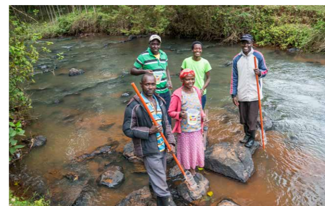
Water towers project of East Africa