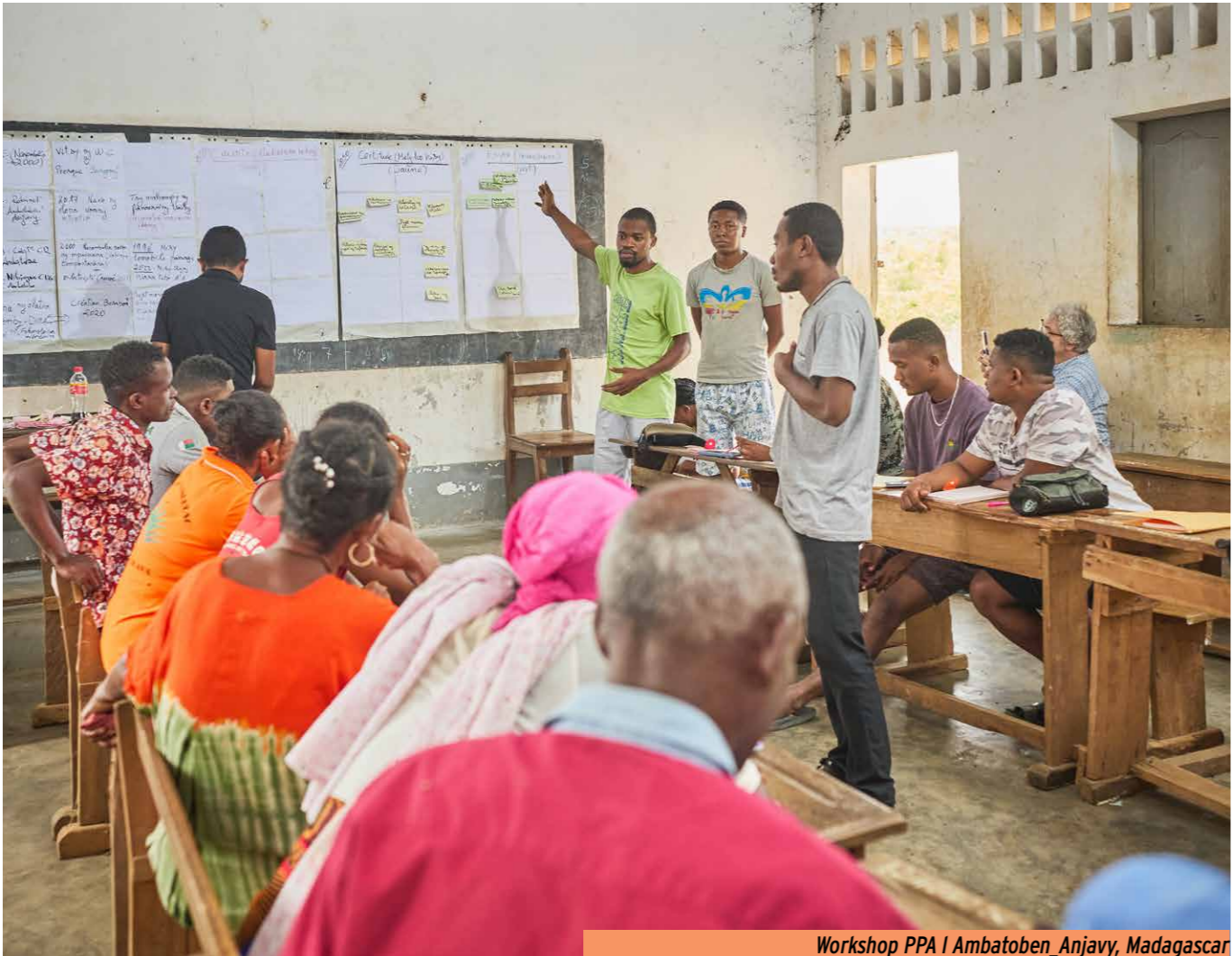
Workshop PPA / Ambatoben_Anjavy, Madagascar