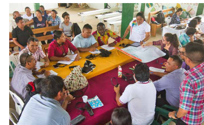
Sustainable Wildlife Management Programme