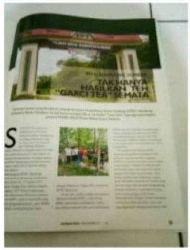
Mayor of Sijunjung: Garci-tea will become icon of Sijunjung