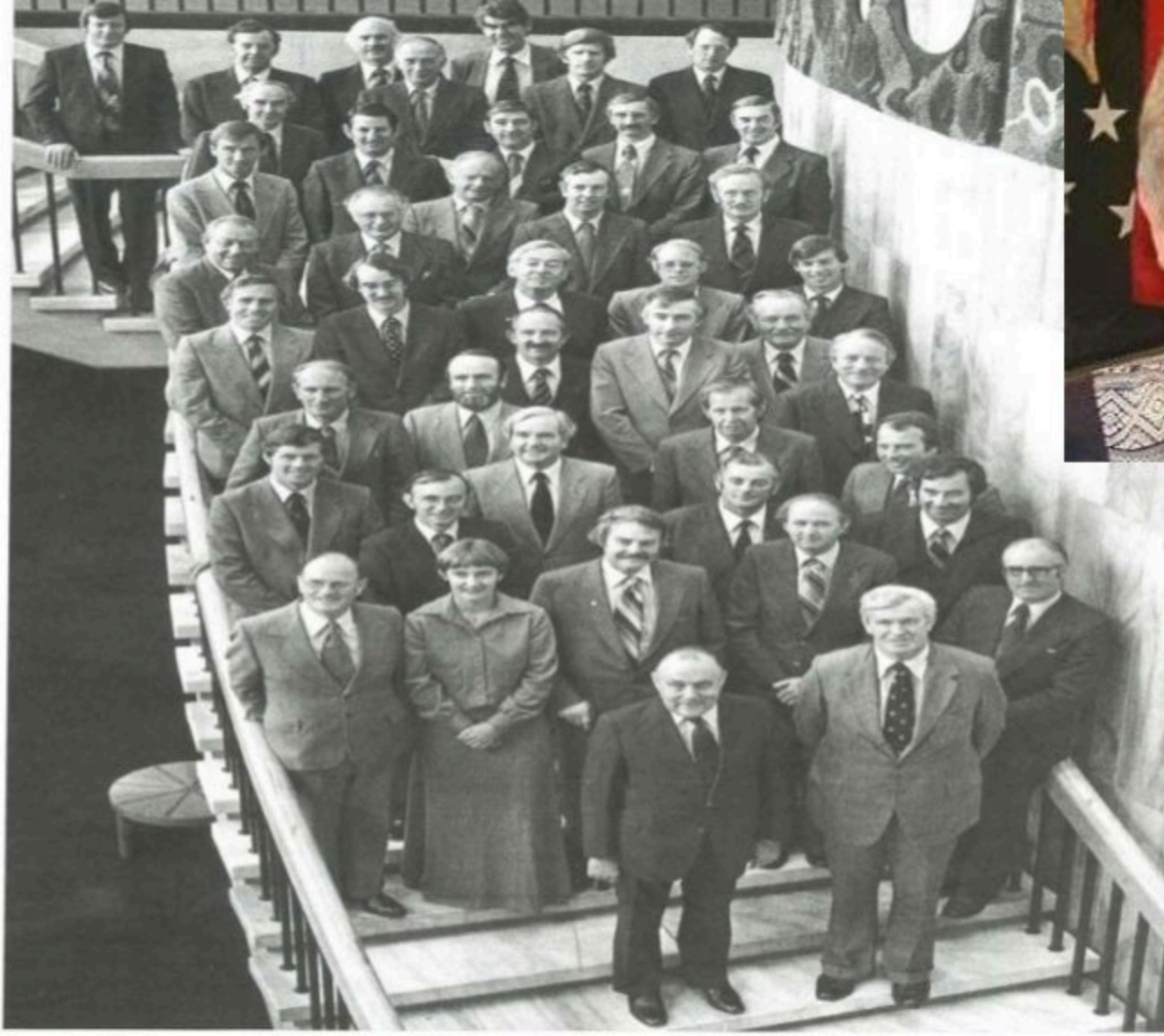
National Party caucus, Wellington, circa 1979. Ref: EP-Politics-National Party, from 1973-01.